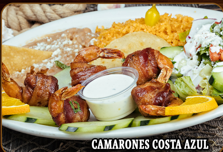
CAMARONES COSTA AZUL

WARNING: Consuming raw or under cooked meats, poultry, seafood, shellfish or eggs may increase your risk of food borne illness, especially if you have certain medical conditions. This item may be served raw or under cooked at your request.