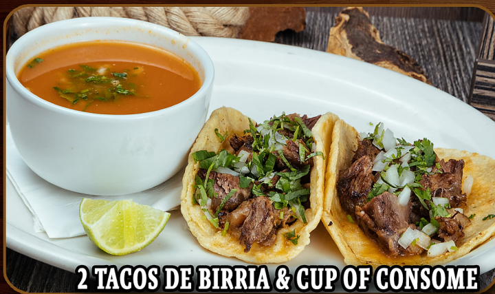
2 TACOS DE BIRRIA & CUP OF CONSOME