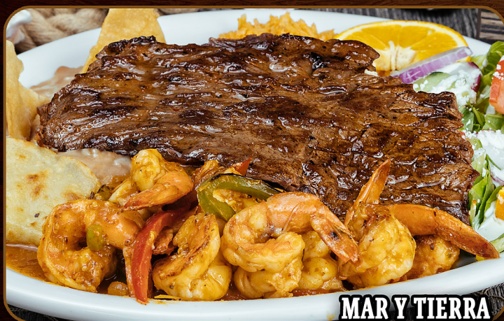
MAR Y TIERRA