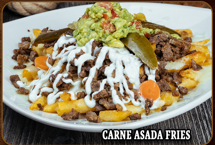
CARNE ASADA FRIES

Choice of meat, chips, beans, cheese, guacamole, sour cream & jalapeños.