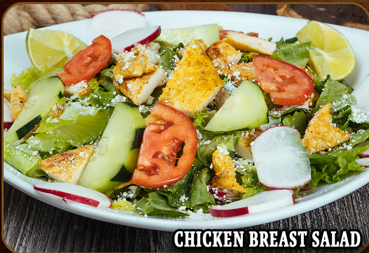
CHICKEN BREAST SALAD