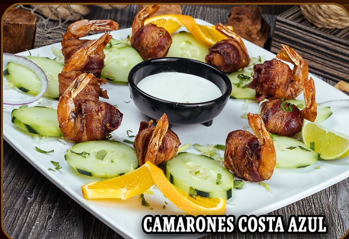
CAMARONES COSTA AZUL