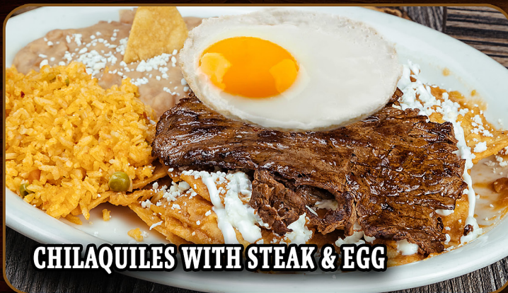
CHILAQUILES WITH STEAK & EGG