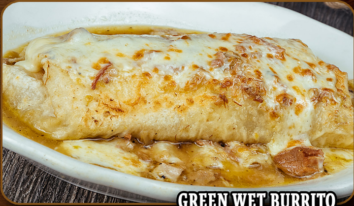
GREEN WET BURRITO