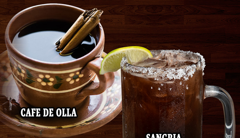
CAFE DE OLLA