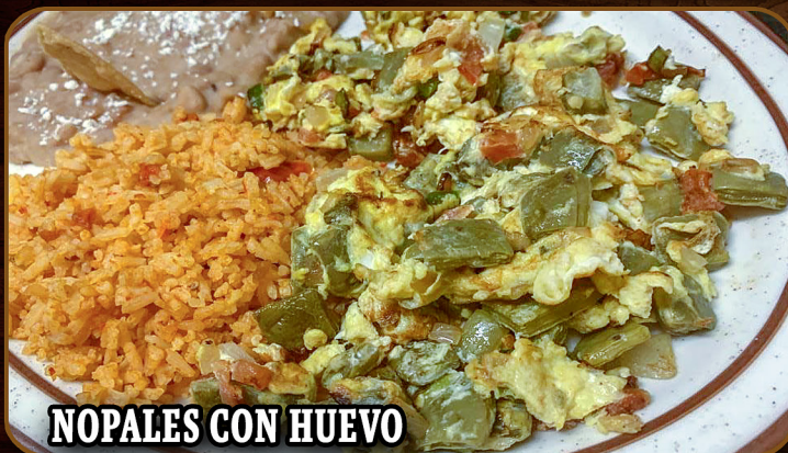
NOPALES CON HUEVO