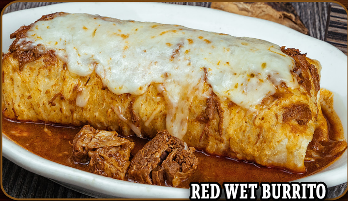
RED WET BURRITO