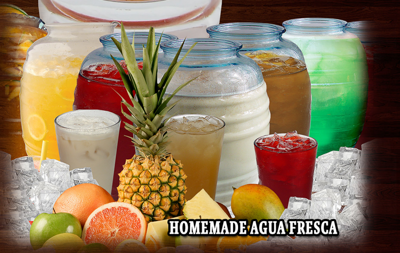
HOMEMADE AGUA FRESCA