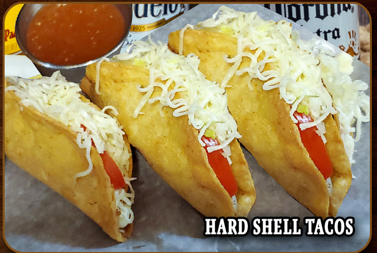
HARD SHELL TACOS