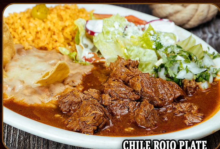
CHILE ROJO PLATE