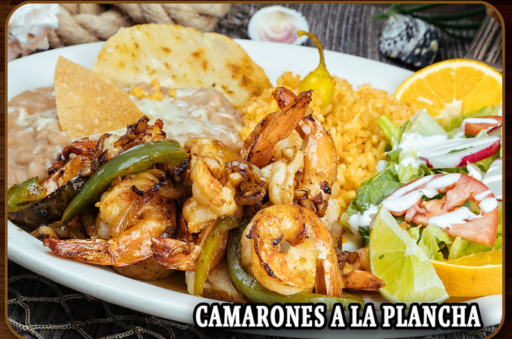
CAMARONES A LA PLANCHA