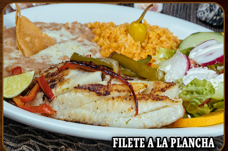
FILETE A LA PLANCHA