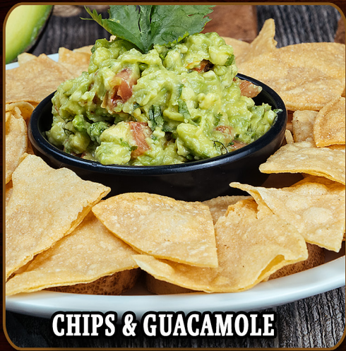
CHIPS & GUACAMOLE