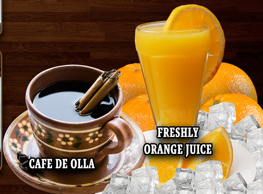
CAFE DE OLLA