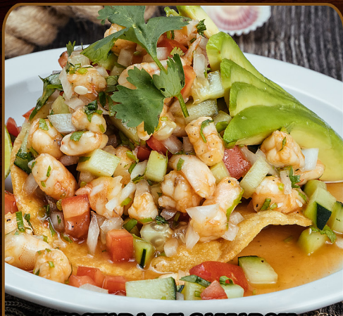
TOSTADA DE CAMARON